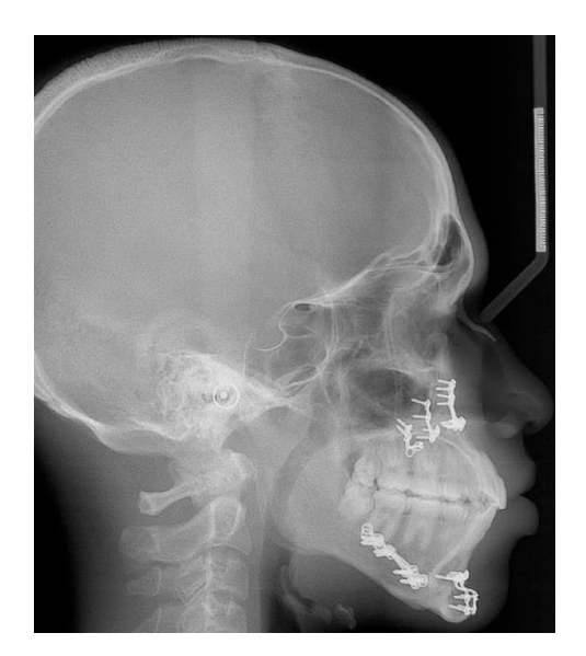
Figure 2 - Post-surgical lateral cephalograms of the same patient who underwent Le Fort 1 osteotomy mostly maxillary impaction with setback

Figure 1 - Pre-surgical lateral cephalograms of the patient with vertical maxillary excess.