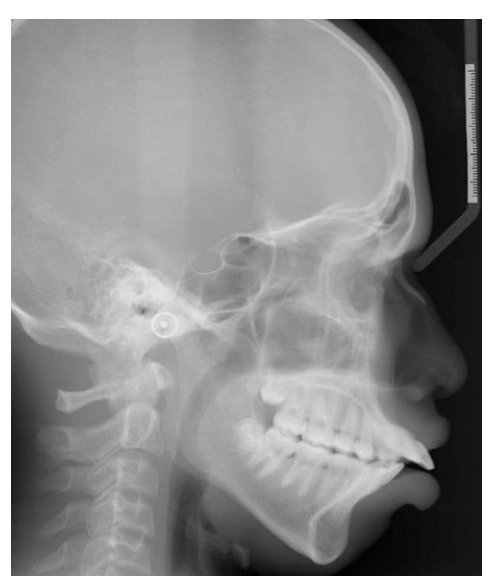
Figure 1 - Pre-surgical lateral cephalograms of the patient with vertical maxillary excess.