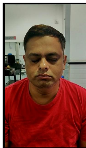
Treatment day 2