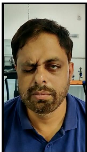
Treatment day 1

The improvement was also seen in SD-curve for left orbicularis oculi which was partially innervated pre intervention to innervated in post intervention. [FIGURE:-1] [FIGURE:-2]