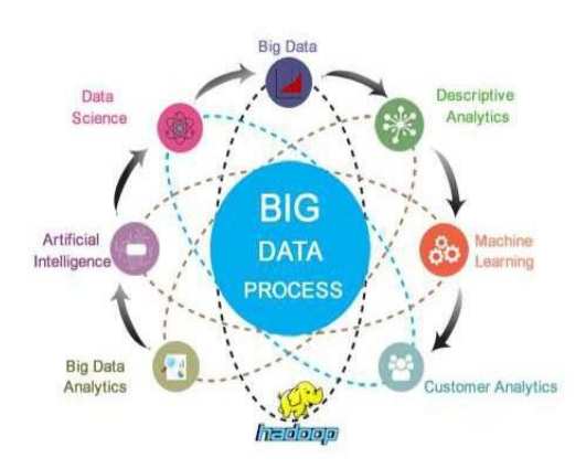
Figure 2: The Big records Processing and analytics

Now-a-days, humans never do that simply choose the acquire data, they favour recognizing a means and significance of the data, and use it to the resource they make choices. Information analytics will be a technique such as making use of evaluating data sets units for the facts but also obtain beneficial Unidentified symbols, connections, and documents [1]. Data analysis consequently has a big influence through lookup Just everything technologies, seeing that choice makers have come to be greater and extra fascinated in getting to know from preceding data, consequently gaining aggressive gain [2]. Figure2 shows big records processing and analytics.