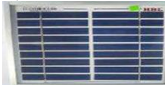
Fig 4: Solar cell

The transmitted flag from the LEDs has got to be identified, demodulated and recognized. So in arrange to distinguish the message flag from the squinting Driven light, we utilize a photo cell or a Sun oriented Cell (which comprises huge no of photo cells associated in arrangement).