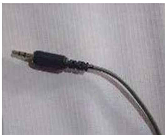
Fig 2: 3.5mm Audio Jack

Here it is utilized to associate the versatile gadget or any other gadget like MP3 Player, etc. with Li-Fi as input sound signal.