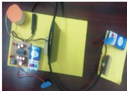
Fig 5 : Circuit Diagram

Through the speaker. The sound intensity received from the speaker varies supported the space of the electrical device from the light-emitting diode arrays. This shows that the knowledge are often received from the road of sight of the light-emitting diode array. Because the distance between light-emitting diode array and therefore the electrical device will increase, the intensity reduces and therefore the light becomes additional scattered so, creating it troublesome for the electrical device to discover all the sunshine rays being emitted.