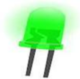
Fig 3: LED

detected by normal Human eye. therefore it'll seem as illuminating albeit they're blinking. therefore modulated signal is transmitted to receiver by visible radiation.