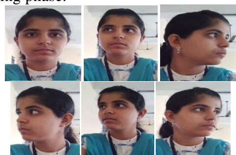
Figure 2: 6 Different angle input images

Every student who belongs to the university must register for this process by giving their basic information, Name, Roll number, Year, and Department. Along with all this information student must upload their pictures based on our sample pictures. The sample will have six images – 2 straight facings, 2 right side facing and 2 left side facing images. These 6 images will be stored in a folder with their name/roll no. This step comes only under the training phase.