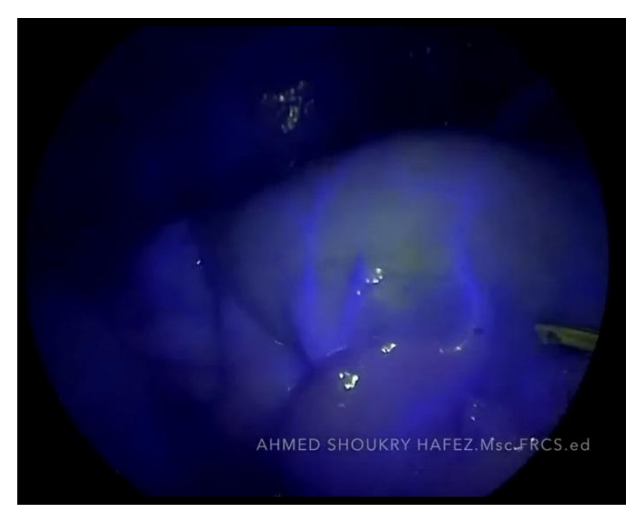
Fig. (2): Using ICG after dissection and before resection.

Fluorescence is excited by exposition to a near-infrared (NIR) light source, therefore a special scope and camera equipped with a xenon light source providing both NIR wavelength and standard light was employed (KARL STORZ GmbH & Co. KG, Tuttlingen, Germany). Switching from standard to NIR light was activated by the surgeon. The vascularization of the colon was analyzed with NIR light following 1 min of the injection of ICG, and waiting until a good perfusion signal was evident, to confirm the level of colonic resection that was chosen by standard visual inspection. The perfusion of the previously identified site of resection was judged as "good" (meaning uniform distribution of fluorescence to the chosen level of proximal colon resection), "poor" (meaning non-uniform distribution of fluorescence to the chosen level of proximal colon resection), or "absent" (if no fluorescence was observed in the 10 cm proximal to the chosen level of colon resection).