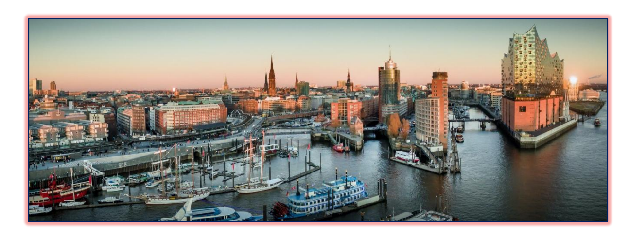
Figure 2: Humburg maritime Arbitration circle.

arbitration, as well as a fear that the "judicialization" of international arbitration proceedings will lead to a decrease in the ability to resolve transnational disputes. Numerous interrelated factors, such as inadequate or unclear arbitration agreements, sluggish procedures, and insufficient criteria for selecting arbitrators, all contribute to the escalating costs and delays in maritime Law. Seafaring arbitrators, for example, can cause unnecessary delays by directing a disproportionately large number of cases to a small pool of experienced arbitrators.