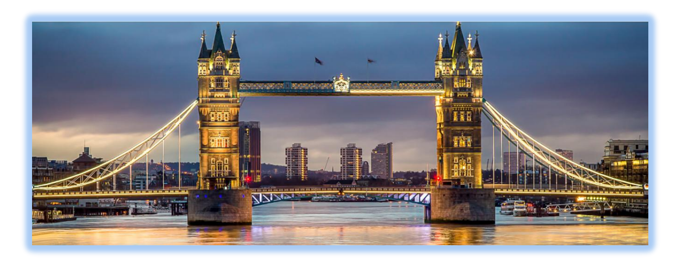
Figure 1: London Maritime Arbitration centre.

resolve maritime disputes due to the litigation process's prohibitively high costs and protracted nature. Evaluating the current situation of maritime dispute arbitration in Bangladesh, the benefits and drawbacks of arbitration compared to litigation, the current international and national legal system, and international and domestic institutions offering arbitration services. The appraisal process can include this. In light of this, the author of this work hopes to gain an understanding of Bangladeshi maritime arbitration law and practice, as well as the benefits and drawbacks of resolving maritime disputes through arbitration as opposed to litigation, as well as the international and national maritime arbitration regime and maritime arbitration organizations. In this work, these subjects will be explored.