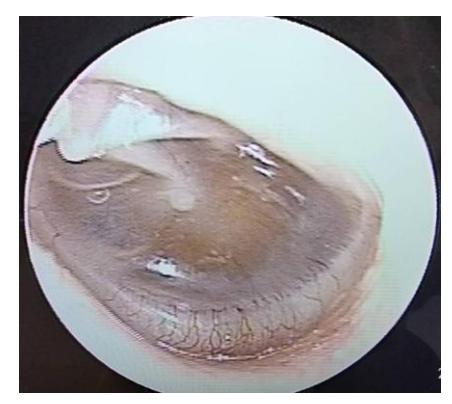
Fig. 1 Otoscopic picture of exudative otitis media

Breathing through the nose is difficult, more through the left side of the nose. The nasal passages are filled with mucus. The posterior parts of the left half of the nose are obturated with cyanotic lumpy tissue. With a digital examination of the nasopharynx, a dense, immobile tuberous formation is palpated. With posterior rhinoscopy, the nasopharynx is occupied by a cyanotic formation. The left choana is completely covered, the right half. Nasopharyngeal fibroendoscopy revealed an asymmetric infiltrate in the left nasopharynx region with a small tuberous surface.