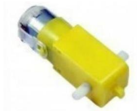
Fig. 2. DC Motor

Automation is a term represents movement of device using without human operations. In this evolution of automation, electric motors play a major role. Electric motor is a device converts electrical energy into mechanical action. It observes a electric energy and rotates the rotor in a flexible angle of motion to the user preferable. Electric engines are extensively arranged into two distinct classes: Direct Current (DC) engine and Alternating Current (AC) engine. In this article we will examine about the DC engine and its working. And furthermore how a stuff DC engines functions. A DC engine is an electric engine that sudden spikes in demand for direct flow power. In any electric engine, activity is subject to basic electromagnetism. In these DC engine A current conveying conductor creates an attractive field, when this is then positioned in an outer attractive field, it will experience a power corresponding to the current in the conductor and to the strength of the outside attractive field. It is a gadget which changes electrical energy over to mechanical energy. It chips away at the way that a current conveying conductor set in an attractive field encounters a power which makes it turn regarding its unique position. It is figured in fig.2.