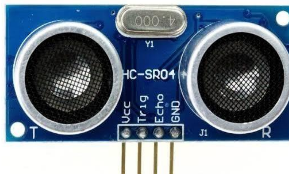
Fig. 1. Ultrasonic sensor snapshot

Sensor which is used to sense any object or things presents in a unit meter distance. It makes the automatic robot into selfless movement and collision avoidance. It clears the component and more efficient in a bounded region of movement. This sensor is mainly purposeful for the own decision making and reliable. It majorly used as a component of security and self-decision making system.