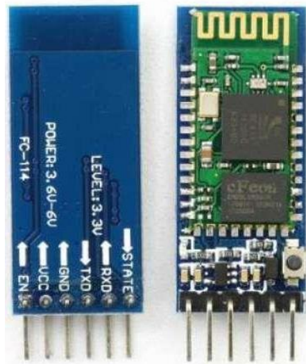
Fig. 3. Bluetooth Module

HC-05 Bluetooth Module is an easy to use Bluetooth SPP (Serial Port Protocol) module, designed for transparent wireless serial connection setup. Its communication is via serial communication which makes an easy way to interface with controller or PC. HC-05 Bluetooth module provides switching mode between master and slave mode which means it able to use neither receiving nor transmitting data. It is also figured in fig.3.