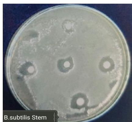
Plate 2: Antibacterial activity against B.subtilis with Oleoresin stem extract.