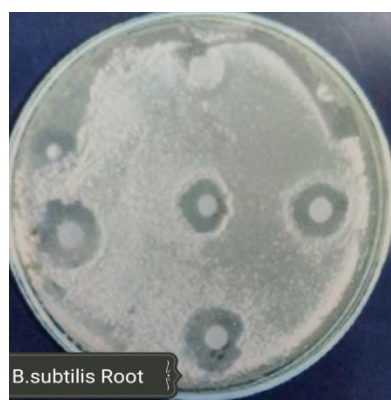
Plate 1: Antibacterial activity against B.subtilis with Oleoresin root extract.