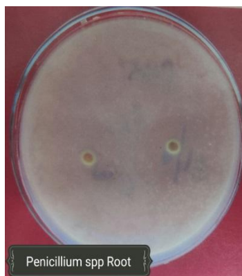
Plate 3: Antifungal activity against Penicillium spp with Oleoresin root extract.