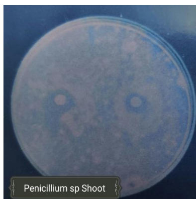
Plate 4: Antifungal activity against Penicillium spp with Oleoresin stem extract.