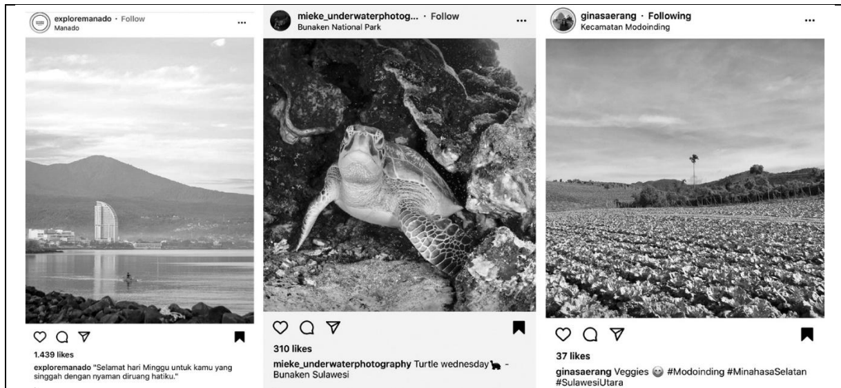
Figure 1. Natural identity campaign of North Sulawesi on social media

"Shining star has become the nickname for North Sulawesi in the world of tourism. An international event was held in Manado, such as several summits attended by six Presidents, the World Ocean Conference (WOC), which brought together 48 countries and Sail Bunaken , which won two world records, in the Guinness Book of Records. With the existence of the Lion Air charter flight to Manado, the rate of Chinese tourists visiting Indonesia increases every year."