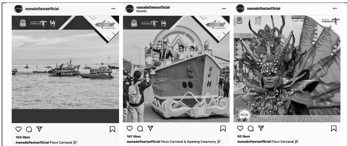
Figure 2. Cultural identity campaign of North Sulawesi on social media

One of the annual agendas listed in the Calendar of Events (CoE) is the Bunaken Festival. Bunaken Marine Park is one of the most famous beautiful underwater park tourist destinations in Indonesia. The festival aims to maintain local tourism's sustainability and improve Bunaken Island's economic welfare. It was usually held in three different places: Bunaken Island, Manado Town Square, the boulevard and usually performed with various district/city cultural activities and attractions. This event was a colorful decorated traditional boat competition, fishing tournaments, cultural carnival competitions, Kolintang competitions, Maengket competitions, cooking fish with foreign tourists, and regional superior products exhibition, "The Bunaken Enchantment Festival intends to preserve aquatic natural resources, and cultural arts manifested through festivals." Cultural events initiated and presented to tourists are created based on the local North Sulawesi culture (see Figure 2).