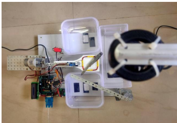
Fig 3: Separating Metal Waste Using Metal Detector

The simplest form of a metal detector consists of an oscillator producing an alternating current that passes through a coil producing an alternating magnetic field. If a piece of electrically conductive metal is close to the coil, eddy currents will be induced (inductive sensor) in the metal, and this produces a magnetic field of its own. The change in the magnetic field due to the metallic object can be detected. If a metal is detected then it will fall in metal garbage bin