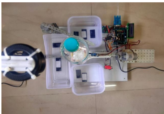
Fig 4: Segregating the Plastics via Pi Camera.

All Raspberry Pi cameras are capable of taking high-resolution photographs. Based on the images taken by camera using image processing the waste is identified as plastics and it will separate in the bio degradable bin with the help of side mounted arm.