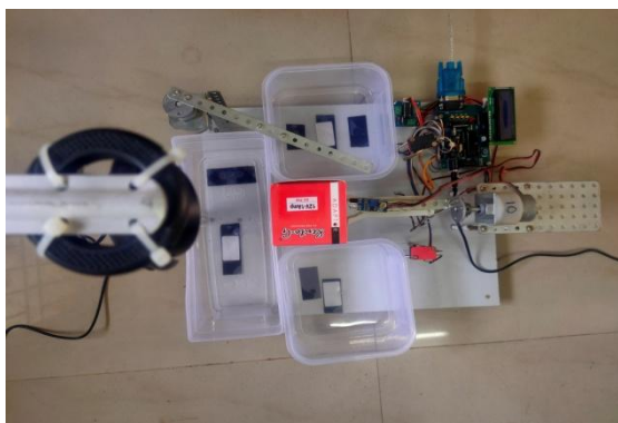
Fig 5: Segregating the Paper Waste via Pi Camera

All Raspberry Pi cameras are capable of taking high-resolution photographs. Based on the images taken by camera using image processing the waste is identified as plastics and it will separate in the bio degradable bin with the help of side mounted arm.