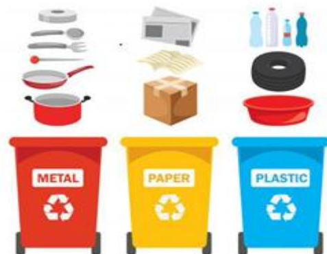
Fig 1: Waste segregation

Waste segregation is dividing waste into dry and wet. Dry waste includes wood and related products, plastics, metals and glass. A wet waste typically refers to organic waste usually generated by eating establishments and are heavy in weight due to dampness. Waste is collected at its source in each area and separated. The way that waste is sorted must reflect local disposal