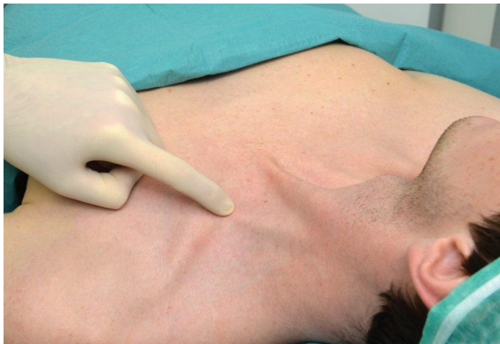
Fig 2: Area of anesthesia in a patient with proper position

and reach from little irregular boluses of midazolam or fentanyl, to a propofol mixture at 25–50 mcg/kg/min, to light broad anesthesia[18].