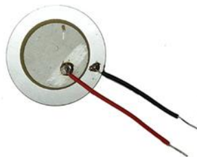
Fig.3. Piezo Electric Sensor

Piezo electric sensors works on the principle of piezoelectric effect. The mechanical force which applied on piezoelectric material which has high sensitivity that uses to measure electric potential. This sensors mostly used in flex motions, touch, vibrations, and shock measurement which has high frequency, transient response to get output. The piezoelectric material which has high stability, available in various shapes and sizes. The output gain which is insensitive to temperature and humidity.