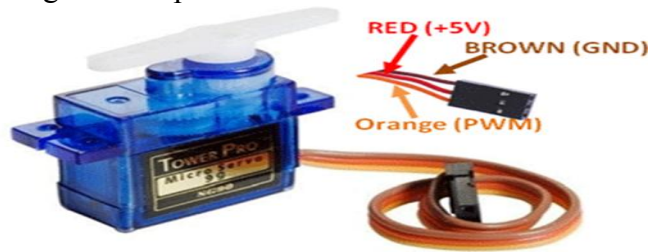
Fig.4. Servo Motor

some difference from the expected output, then there will be a error signal and the motor stops and doesn't show any changes in the position.