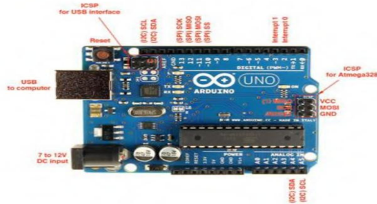
Fig.2. Arduino UNO

processor (which all computers have) and memory, as well as some controllable input/output pins.