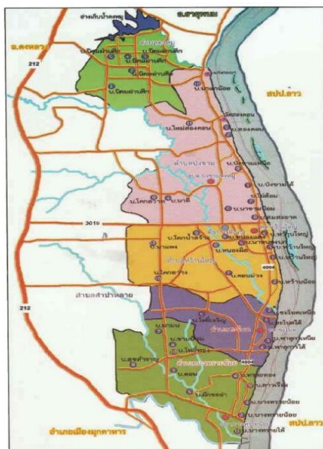
Photo 2: Location of Wan Yai District, Mukdahan Province

As a result of the disparity in the area, tourism become an essential mechanism for sustainable economic development. That is to say, Mukdahan has many highlighting places: it has one of the most beautiful banks of the Mekong River in Thailand and also has interesting attractions including archaeological sites, religious monuments and beautiful scenery. Furthermore, there are ancient traditions; for example, ancient drums that have important cultural values of 8 tribes, WatManopirom is an important Buddhist temple, and KaengKabao islet is a natural tourist destination, etc. These data are associated with the Mukdahan Province Development Plan (2018 - 2022) which has focused on provincial economic development with a strong focus on the development of tourism along the Mekong River. (Mukdahan.2018) From the aforementioned reasons, the researcher was interested in Wan Yai District, Mukdahan Province as a study area. This research is a further study which called “Thai Special Economic Zone and Economic Border: Case Study of Wan Yai District, Mukdahan Province”. From the results of the aforementioned studies, it was found that the development of such areas is a sustainable tourism city. This has become a critical strategy for sustainable local economic development in order to reduce the inequality of income distribution. (SuchitraRitsakulchai. 2019: 69-78)