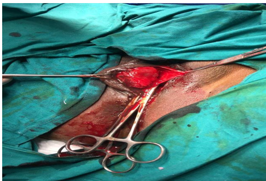
Figure-1: Chocolate fluid from Bartholin's gland

The initial diagnosis of Bartholin gland cyst was made and the patient was planned for Bartholin cyst marsupialization. Intraoperatively the cyst ruptured during marsupialization and the dark chocolate brown fluid was drained and clinical diagnosis of endometriosis was made [Fig 1,2]. Postoperative period was uneventful Histopathology report was consistent showing foci of endometriosis in Bartholin glands. She received one dose of DMPA 150 MG postoperatively. Patient is on follow-up and no recurrence of cyst till date