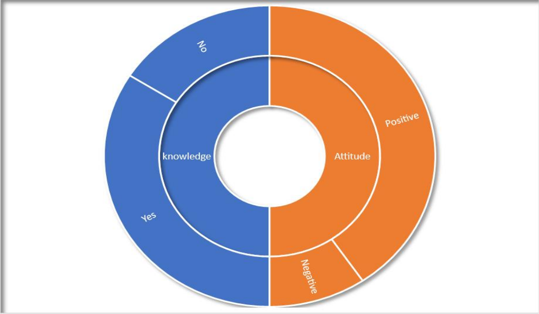
Figure (1): Distribution of knowledge and attitude about Utilization of laboratory among primary care the physicians

This table 4 shows regarding the knowledge the majority of participant answer Yes were (68.0%) about Utilization of laboratory among primary care the physicians , followed by No (32.0%) while a significantly associated were P < 0.001 and X^2 (25.205), while regarding the attitude the majority of participant positive attitude were (81.0%) while negative attitude were (19.0%) while a significantly associated were P < 0.001 and X^2 (75.645) .