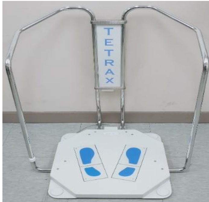
Figure 1. TETRAX biofeedback device used in this study