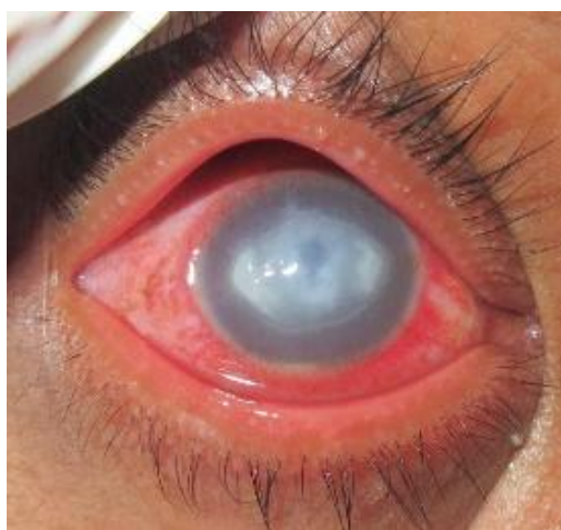
Figure 1. The picture shows an oval-shaped central corneal ulcer with ring ulcer, feathery stromal infiltration, and minimal hypopyon. This picture was taken when the patient initially presented to us.

His best-corrected visual acuity (BCVA) was 1/300. Slit-lamp examination revealed found oval-shaped corneal defect at central zone sized 5x7.5 mm, appeared grayish-white, dry-appearing stromal infiltrate that has regular feathery margins, ring ulcer, positively fluorescence test, and minimal hypopyon (less than 1 mm) in the anterior chamber, van Herrick criteria grade 2-3, and brown iris. Other details were difficult to evaluate obstructed by turbidity of the refractory media. Corneal scraping with Gram staining showed of septate hyphae fungal and polymorphonuclear cells. No bacteria were found in the staining. Other techniques, such as potassium hydroxide (KOH) and cultivation, were not performed because of a lack of sufficient material.